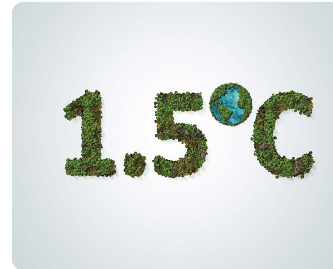
1.5 degrees Business Leaders Science-Based Targets