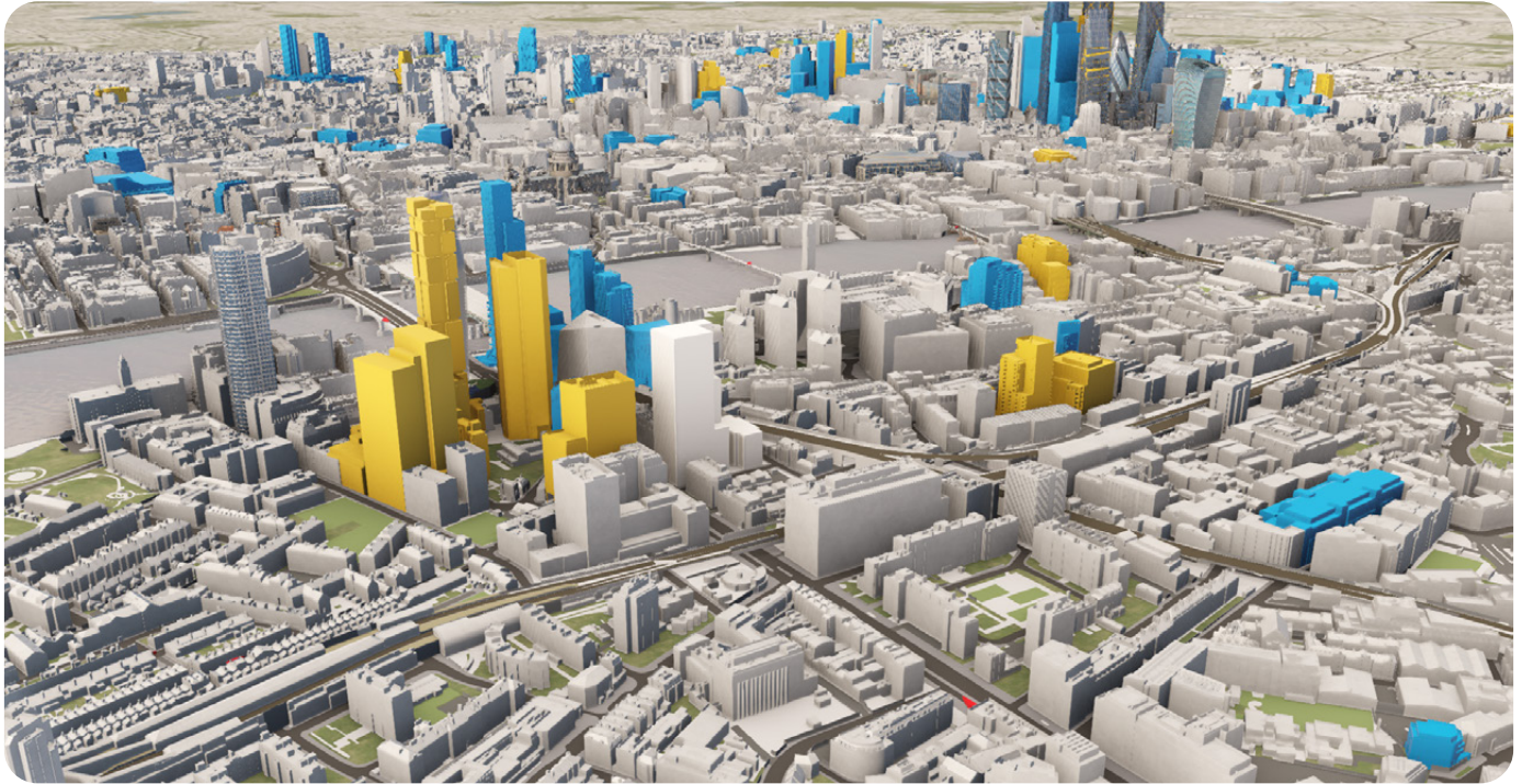
Consented developments Under construction