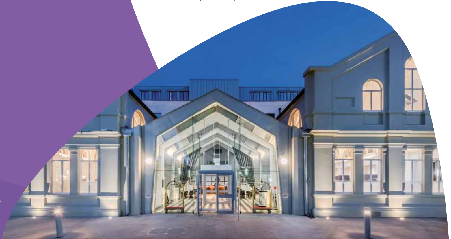
The Titanic Hotel