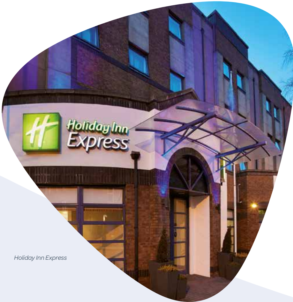
Holiday Inn Express